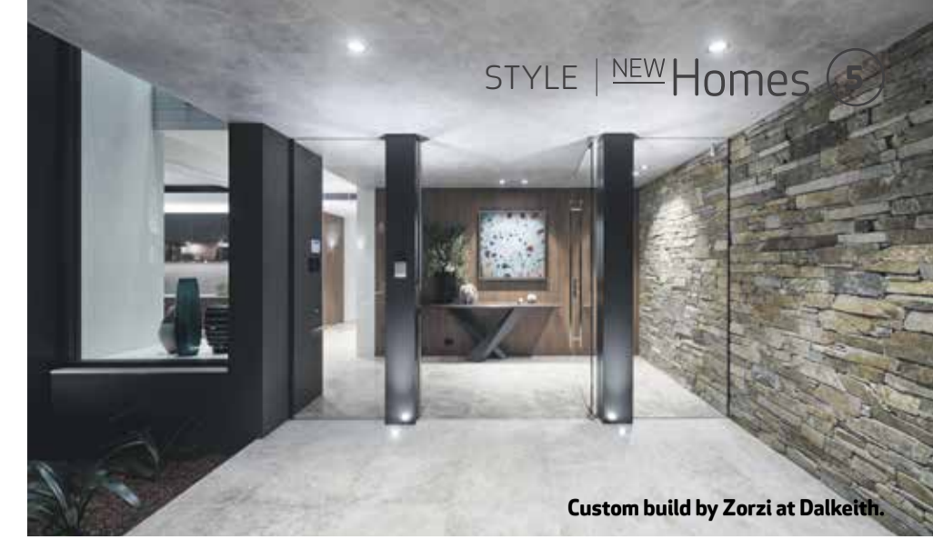
Custom build by Zorzi at Dalkeith.

"As most stone comes in a tile format, you need to lay it in a manner that retains the essence of it," he said.