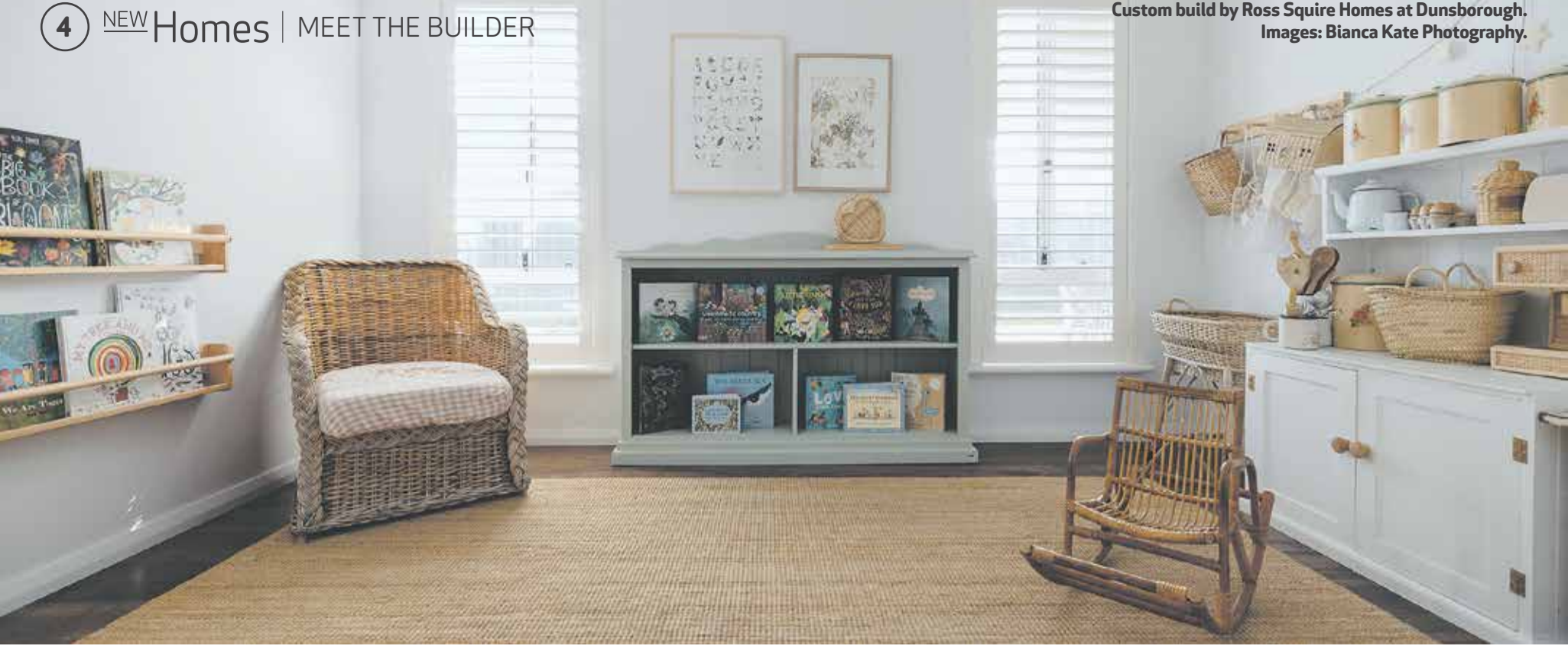
Custom build by Ross Squire Homes at Dunsborough.